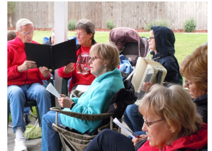
Pentecost Prayer Vigil