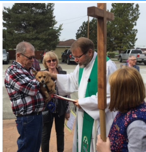
Blessing of the Animals-Oct 7